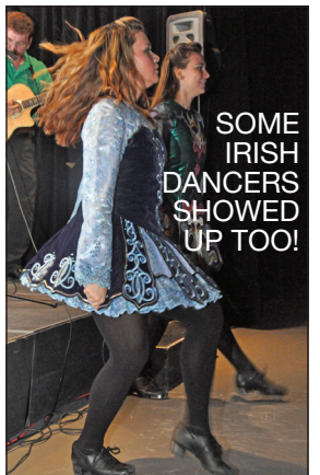
SOME IRISH DANCERS SHOWED UP TOO!