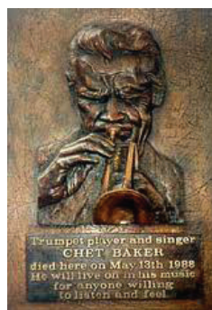
Plaque at the Hotel Prins Hendrik, in Amsterdam

A plaque outside the hotel now memorializes him.