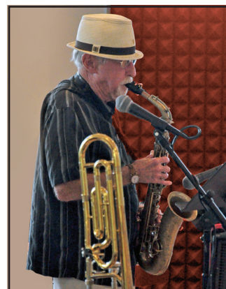
Scatman, jammin' at the PSL Botanical Gardens

NONPROFIT ORG. US POSTAGE PAID FT. PIERCE, FL PERMIT NO. 130