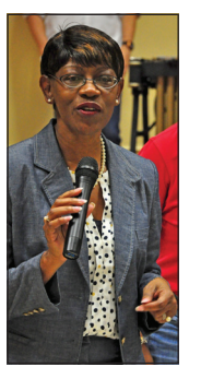
COUNTY COMMISSIONER FAYE OUTLAW