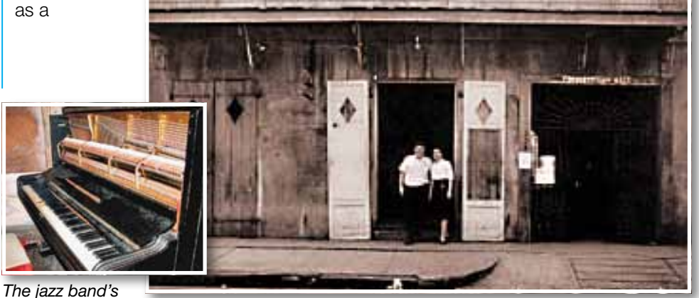
old piano at the Hall in New Orleans